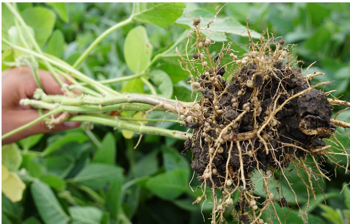
Figure 3. Nodulated roots of soybean plants from the field.

Bradyrhizobium lupini for lupins; Mesorhizobium loti for sulla and trefoil; Rhizobium vigna for cowpea and other Vigna species, peanut; Rhizobium simplex for sainfoin; Bradyrhizobium japonicum for soybean (Figure 3).