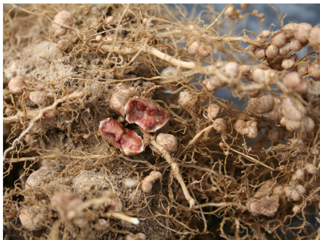
Figure 1. A close-up photograph of a split nodule showing the characteristic pink colour. This is indicative of a successful establishment of the rhizobium and active biological nitrogen fixation.

charged with oxygen. This explains why healthy root nodules are pink. The presence of a large number of nodules that are pink when split open is a reliable indicator of successful establishment of BNF in legumes crops (Figure 1).