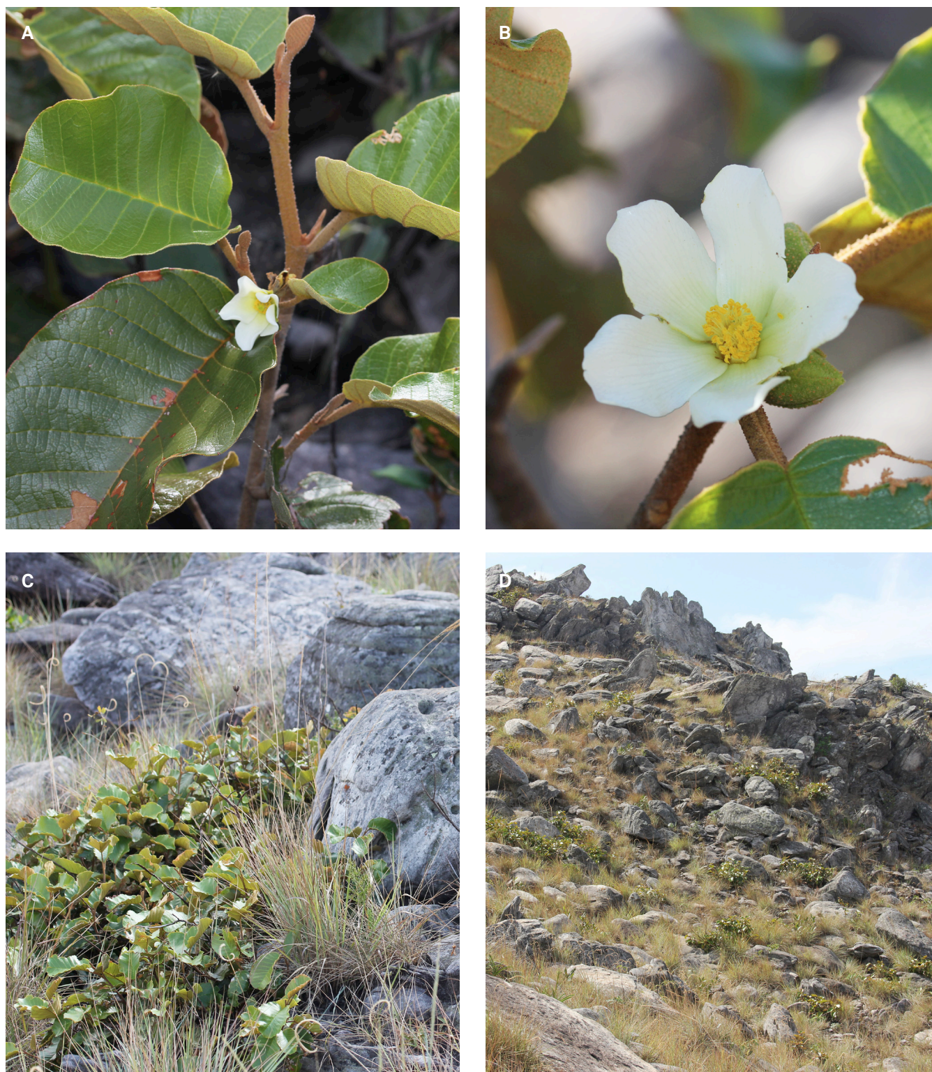
Fig. 2. – Photographs of Pentachlaena vestita Andriam., Lowry & G.E. Schatz. A. Flowering branch; B. Close-up of flower (note dense indument on lower surface of leaf); C. Adult plant; D. Habitat of type locality, with open wooded grassland and bushland/Tapia woodland and rocky quartzite substrate.