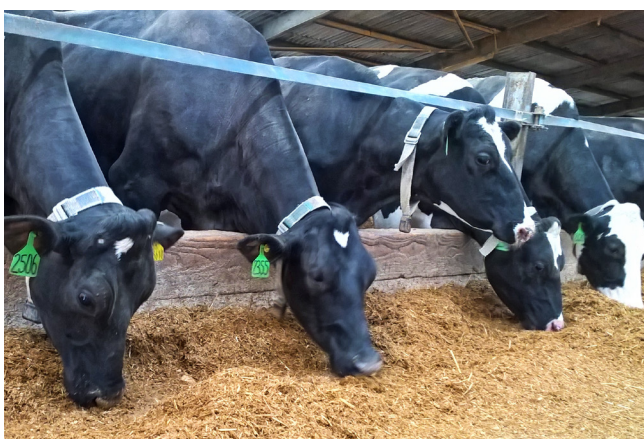
High yielding cows at feed fence.

Table 2 shows that soya can be substituted with faba bean and additional DUP from protected rapemeal to achieve a similar level of protein, bypass protein and starch content in a diet for a 650 kg cow producing 30 litres of milk at 4% fat and 3.3% protein. The methionine content is lower with the faba bean ration but could be rectified with the inclusion of a rumen-protected methionine supplement such as Metasmart® (which is 50% rumen protected) to help maintain milk yield and milk protein content. While the above study from Cherif did not appear to adjust the diet to provide a similar level of bypass protein, milk output and milk protein yield were still maintained. This raises the question whether there is over-emphasis on requirements for bypass protein in high yielding cows.