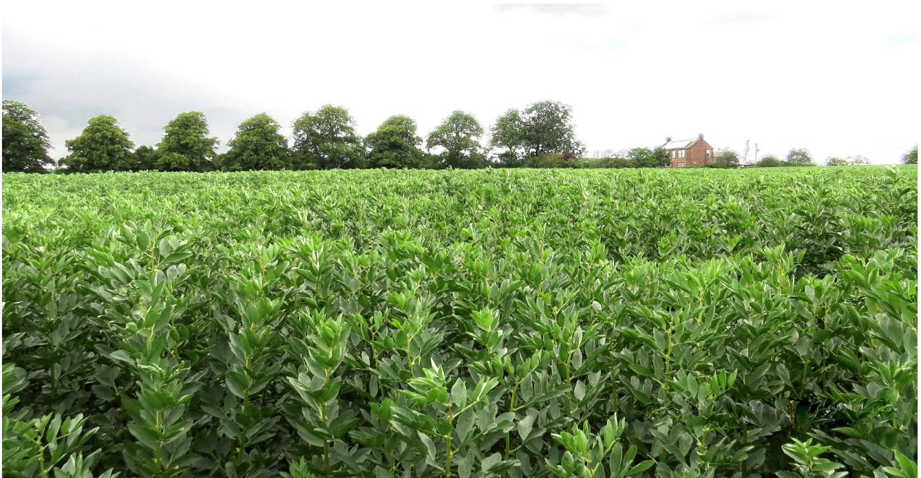
A crop of faba bean growing in Scotland.

yielding cows. The use of home-grown or locally produced faba bean opens up opportunities to reduce costs and to exploit markets for soya-free and GM-free dairy products.