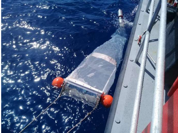
Figure 2 . Manta net picture and its parts (left): stainless steel structure with a front opening of 60 x 40 cm and rear opening of 60 x 25 cm. On the sides, two stainless steel ailerons. Some modifications are used such as the use of buoys (right).