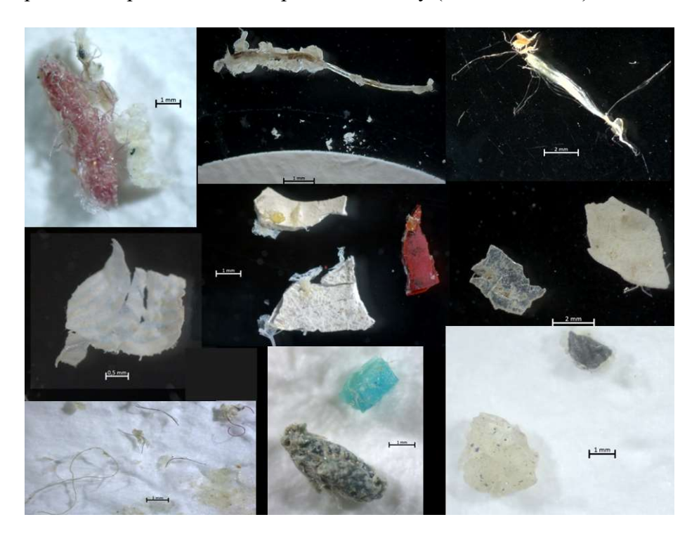
Figure 1. Photographs of different types of MPs collected in seawater in Ría de Vigo, NW Spain.

MPs are heterogeneous, exhibiting a range of shapes or morphologies from spherical beads to angular fragments and long fibres (Fig. 1). According to their origin, MPs are either primary or secondary. Primary MPs have been specifically manufactured with their size and include virgin plastic pellets used as raw materials for the fabrication of different products (Browne et al. 2011; Fendall and Sewell 2009; GESAMP 2019). According to GESAMP, secondary MPs "result from wear and tear or fragmentation of larger objects" (GESAMP 2019). The shape of plastic fragments is relevant because it determines drag, the viscous force exerted by a flowing fluid on any submerged particle that governs its terminal settling velocity and, therefore, the time a particle is being transported by water or air. Besides, and concerning the smaller sizes, particle shape influences suspension stability (Kim et al. 2015).