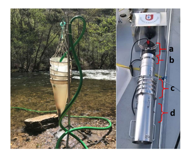
Figure 3. Example of sampling in a river with a battery of nets with different mesh size fed by a pump with known water flow. In situ pump built by KC Denmark (Silkeborg, Denmark) and EU CleanSea project; a: Faulhaber Swiss motor system, 3863H0224CR - 24V, GB 150 nm with a planetary gearing 44/1 - 4,8:1 16 nm; b: Water inlet with rotating blades to pull in the surrounding water; c: stack of filters with inserted 500 μm, 300 μm and 50 μm filters; d: water outlet and flow meter (right)

It is also important to mention the recent use of new systems (see Fig. 3), like in situ pumps, fractionated cascade filtration and other devices, suitable to collect suspended microplastics in the surface and also in the water column (Abeynayaka et al. 2020; Karlsson et al. 2020; Rist et al. 2020; Schönlau et al. 2020; Setälä et al. 2016). The main improvement of these systems is the more accurate measurement of the water volume filtered. Sediment sampling can be done in intertidal or subtidal areas. Intertidal sampling is generally performed seasonally to account for tide variability. Usually, the sediments are sampled along transects (approx. 100 m) set in parallel to the water edge and defined by GPS position. Sampling sites can be